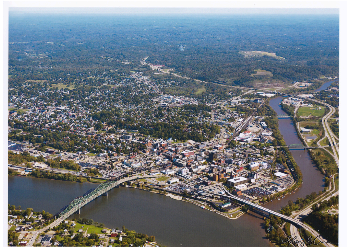
Parkersburg West Virginia

A stereotype of West Virginia is rarely complimentary, but many who move to the area become attached and remain here after they retire. Their children have fond memories of growing up, attending school, taking part in sports, the arts, or hiking or biking. Many think this is a good place to live and raise their children. Here's why we think so too! In the first place, it's because of the people here. They are friendly, care for each other, are easy-going and generous. Their commitment to the communities they live in runs deep. Schools, stores, and medical care are close by. No matter where you are or where you are headed, it is likely to be less than a 20-minute drive away.