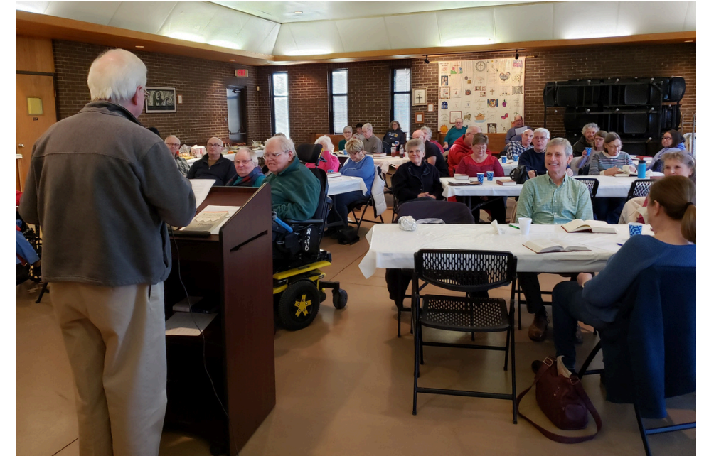
2024 Lenten Series

At various times through the year, such as during Advent and Lent, our Rector offers different topics to help further our understanding of our faith, Episcopal traditions and a more informed understanding of the Gospel.