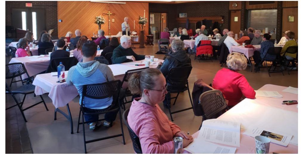
Envisioning Our Future

Our Interim Rector began his work with us on October 1, 2023. Our initial focus was on bringing stability and continuity to the parish and establishing a Discernment Committee that would be responsible for preparing the Parish Profile and conducting the search process. The Interim Rector worked with the Vestry, Committee and congregation to focus on the present and the need to continue and build on the ongoing life of the parish. There was also attention to the past, determining the strong points of the parish's vibrant history and making sure that the parish wasn't stuck in the past. A major step in this process was a well-attended Sunday morning event entitled "Celebrating Our Heritage." After several months the Interim Rector, Vestry and Discernment Committee with the support of the Diocese felt that the parish was ready to move forward into the future with a new Rector. The key step in preparing for the future was an event entitled "Envisioning Our Future," enveloped in a service of Holy Eucharist on April 14, 2024. Over 50 people participated, including the Vestry, Discernment Committee, lay leaders, rank-and-file members and several youth. In response to the Gospel and using an appreciative inquiry process, they discerned the core values of the parish, their hopes and dreams for the parish, and the characteristics of the person that God is calling to walk with us as our new Rector. The results are reflected in those sections of our Profile.