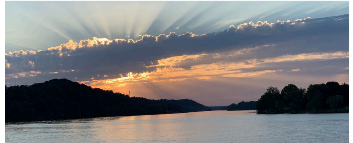
View From Point Park, Parkersburg

We have three options for air travel. Our local airport offers direct flights to Charlotte, NC with connections throughout North America, the Caribbean and Europe. Or we can take flights out of Charleston, WV and Columbus, OH to cities throughout the U.S and beyond. We are also at the intersection of I-77 and US 50, major highways that provide easy access to cities such as Columbus, Pittsburgh, Cleveland, and Cincinnati.