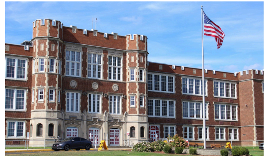
Parkersburg High School