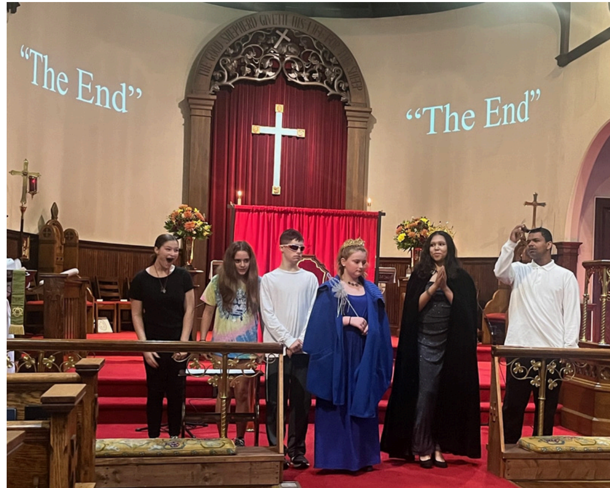
Good Shepherd Drama Group October 2023