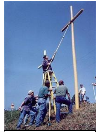
A team restores a set of Coffindaffer Crosses in WV

On the next few pages, we'll see exactly what each category includes and how much we have budgeted to spend for each.