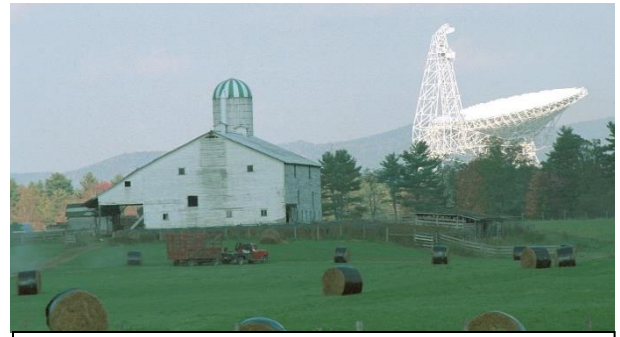
Gathering hay into a barn near the Green Bank Observatory, Pocahontas County

The Diocese of West Virginia is blessed with several streams of income to make sure that the work we begin can be completed. This includes direct support from parishes and various endowments and funds that directly support the work of the Diocese.